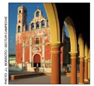
Church of San Isidro Labrador, Seybaplaya.

It was one of the most important Mayan sites of Campeche in the Late Classic Period (700 – 900 AD). The city had a complex channel system and broad stone avenues which linked the most relevant architectural developments. Therein one can see different architectural styles as Petén, Chenes and Puuc.