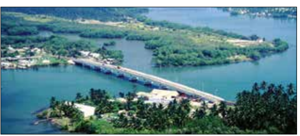
Puerto Ceiba-El Bellote-Chiltepec Bridge

Its natural richness is constituted by beach banks, numerous lagoons, abundant marshes, mangroves and rivers. This place is ideal for observing the aquatic flora and fauna and the sunsets are splendid for boat touring.